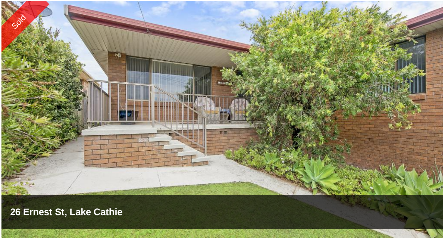
26 Ernest St, Lake Cathie