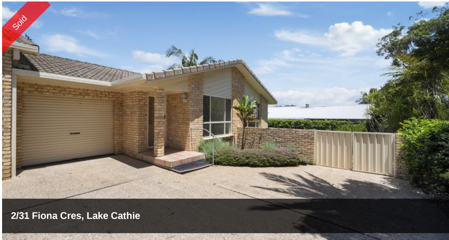
2/31 Fiona Cres, Lake Cathie