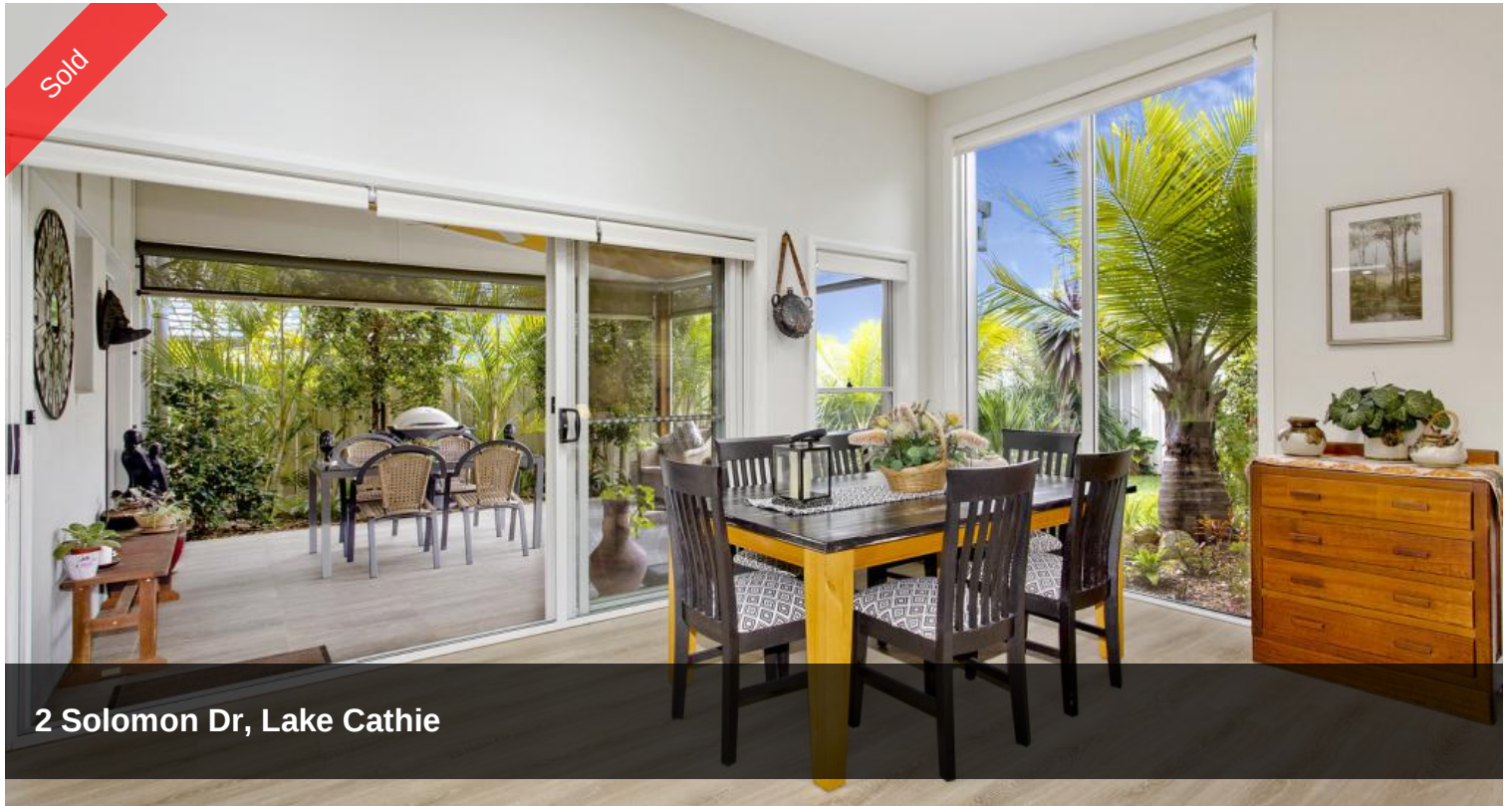
2 Solomon Dr, Lake Cathie