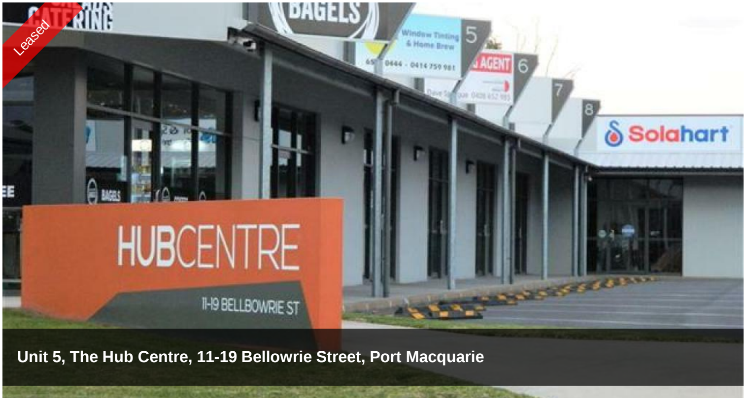
Unit 5, The Hub Centre, 11-19 Bellowrie Street, Port Macquarie