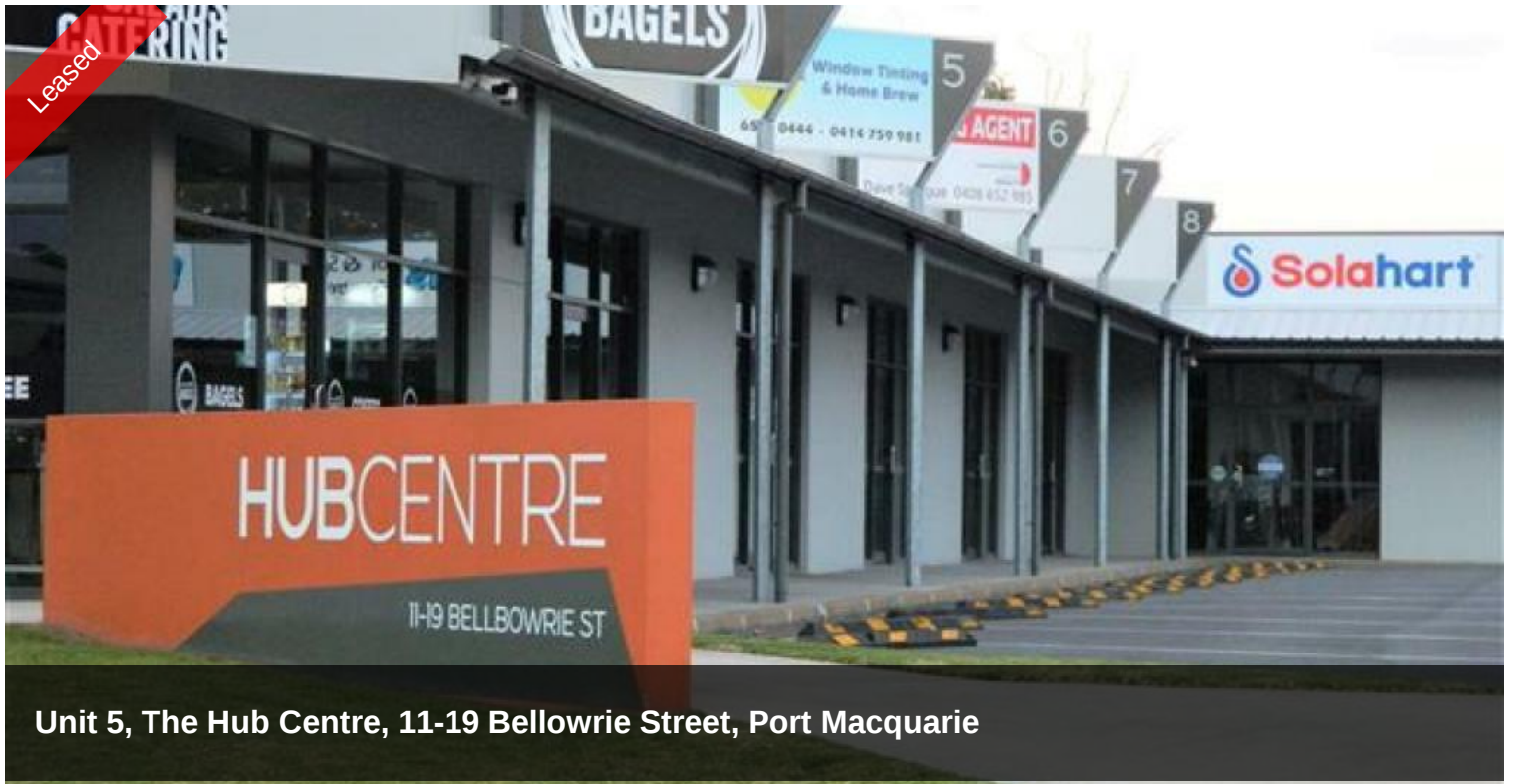
Unit 5, The Hub Centre, 11-19 Bellowrie Street, Port Macquarie