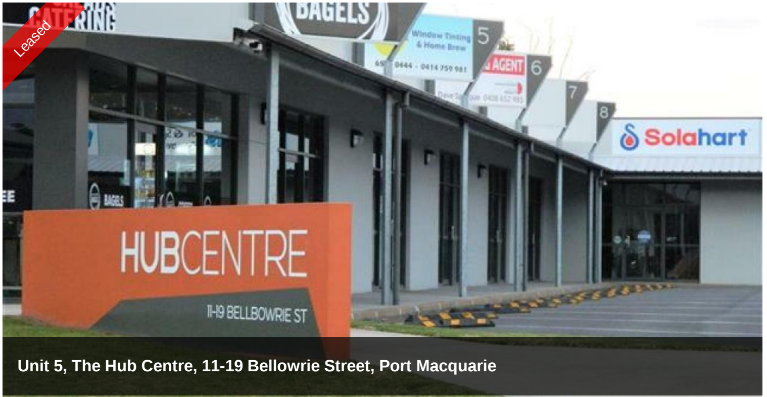
Unit 5, The Hub Centre, 11-19 Bellowrie Street, Port Macquarie