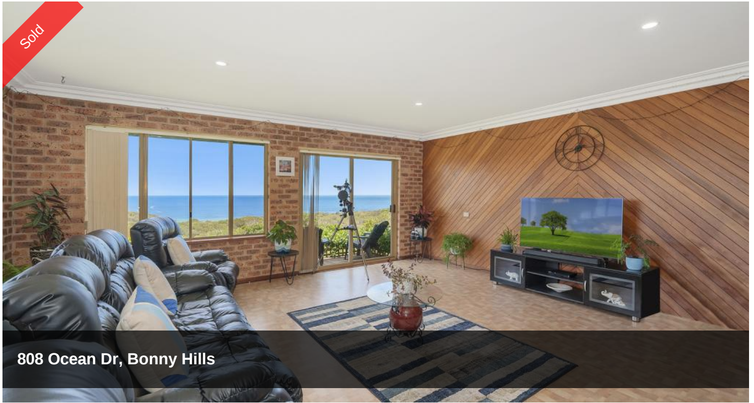
808 Ocean Dr, Bonny Hills