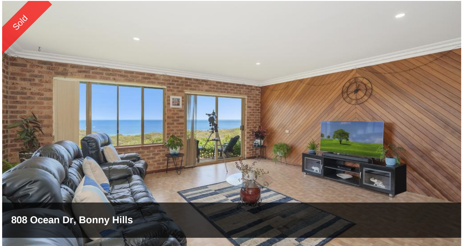
808 Ocean Dr, Bonny Hills