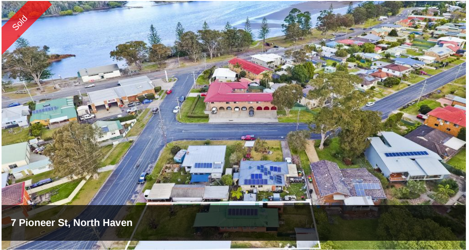
7 Pioneer St, North Haven