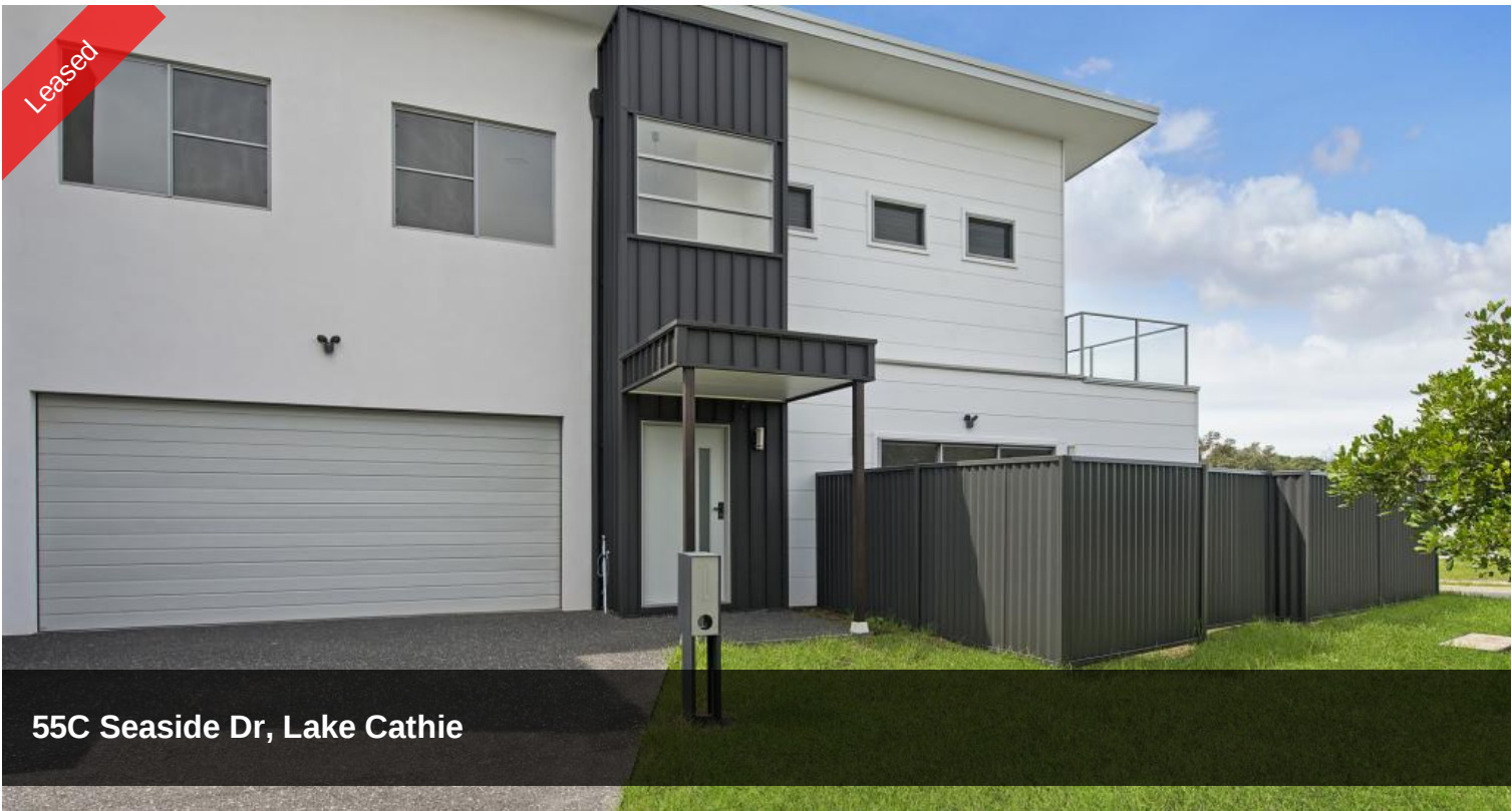
55C Seaside Dr, Lake Cathie