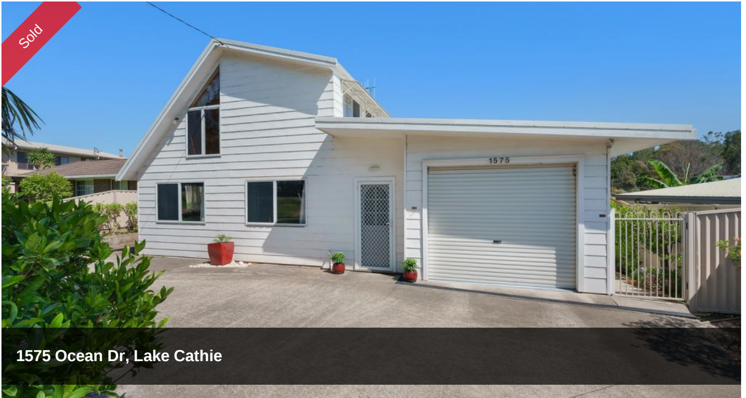
1575 Ocean Dr, Lake Cathie