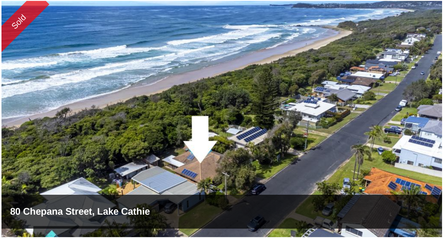
80 Chepana Street, Lake Cathie