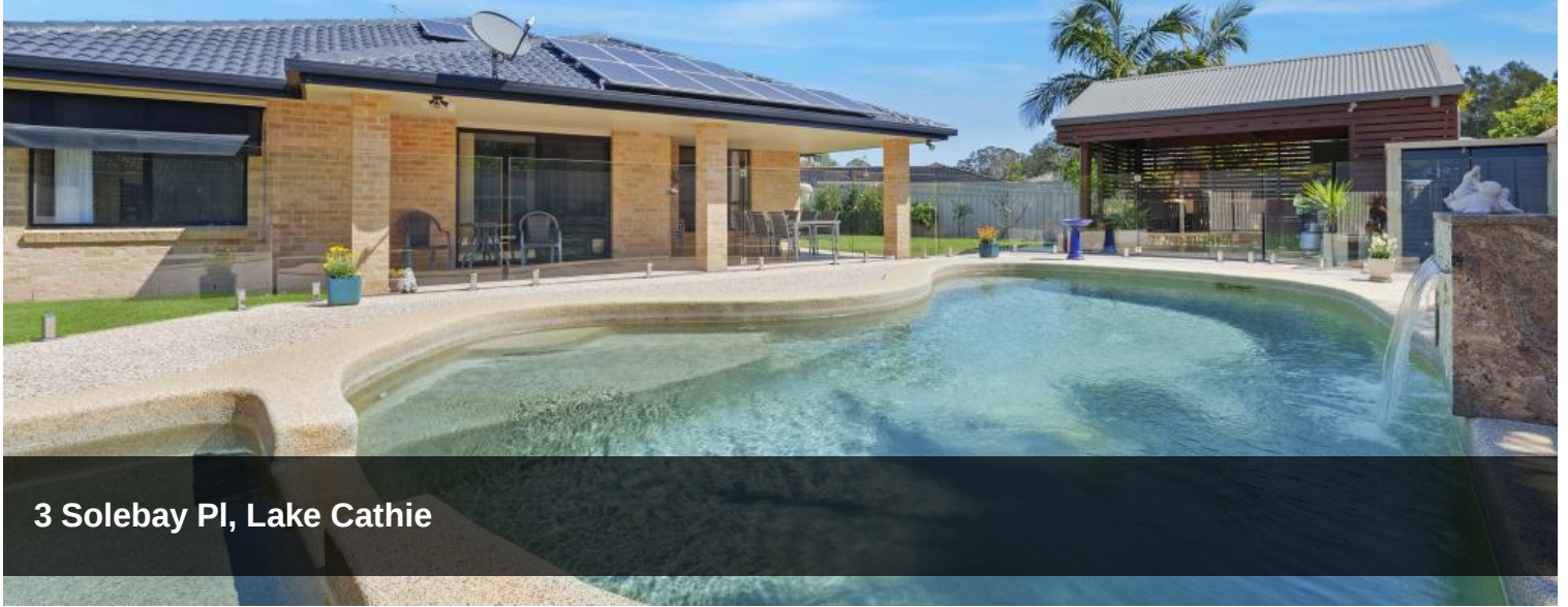
3 Solebay Pl, Lake Cathie