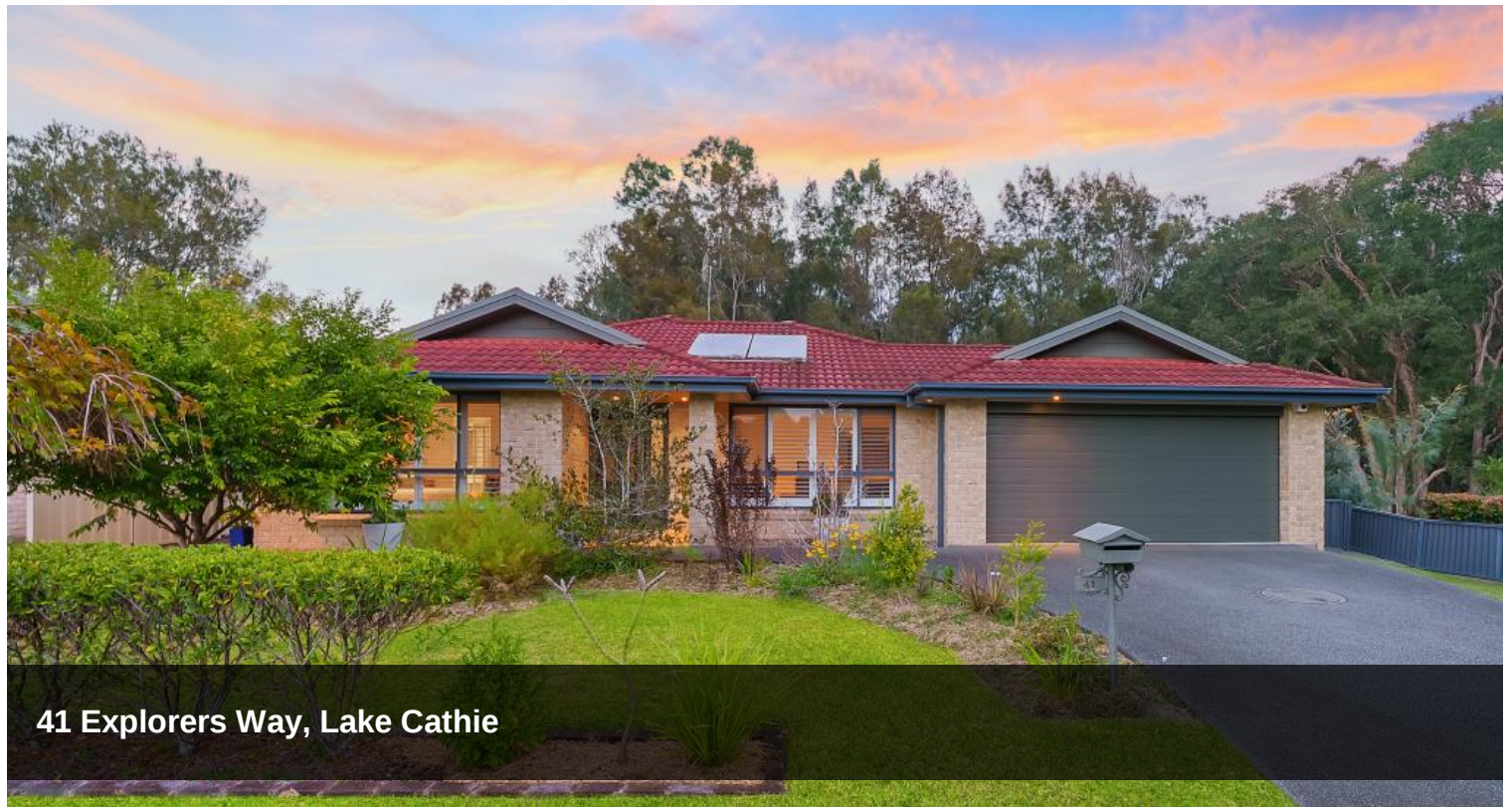
41 Explorers Way, Lake Cathie