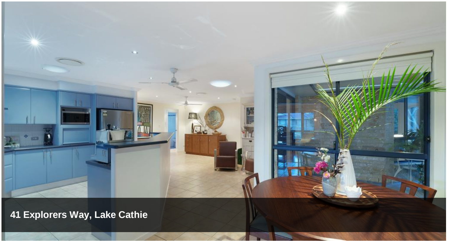
41 Explorers Way, Lake Cathie