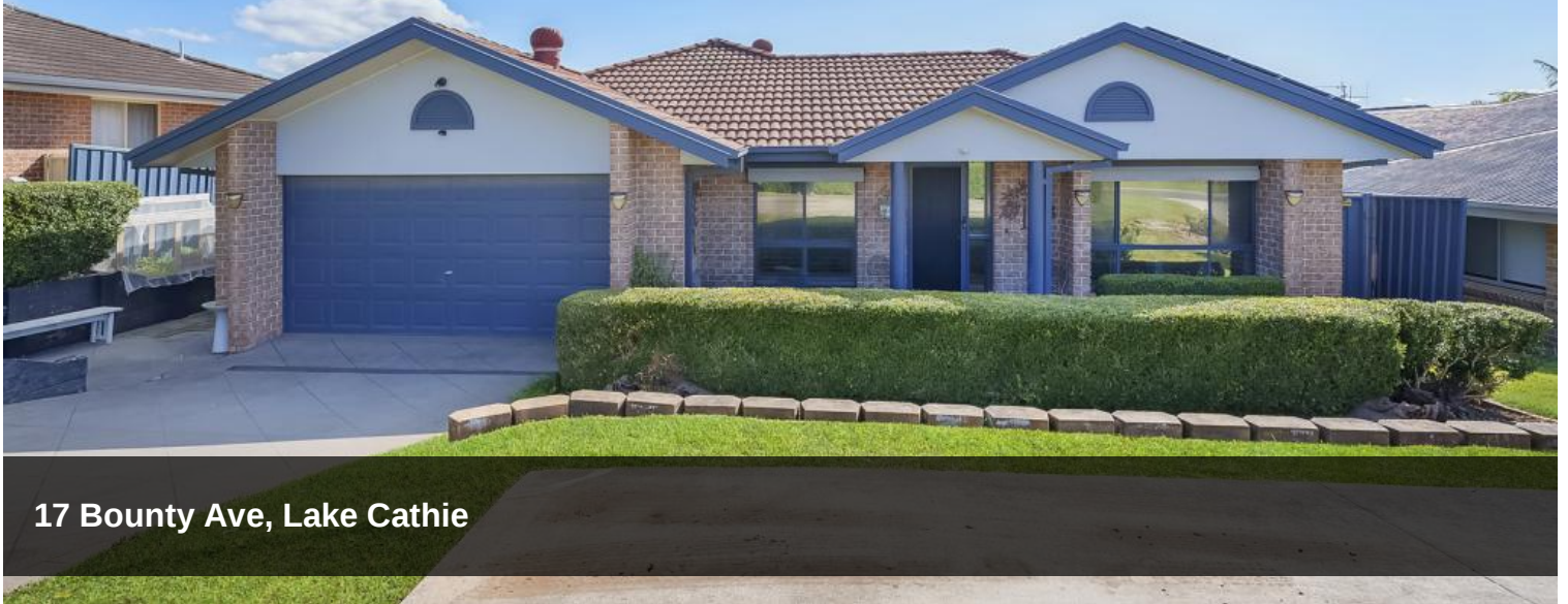
17 Bounty Ave, Lake Cathie