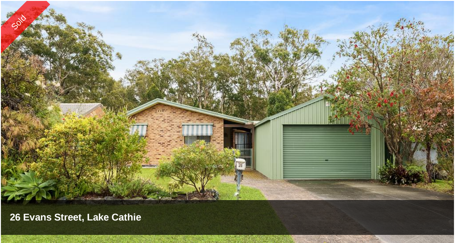
26 Evans Street, Lake Cathie