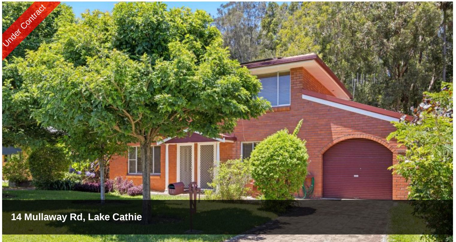
14 Mullaway Rd, Lake Cathie