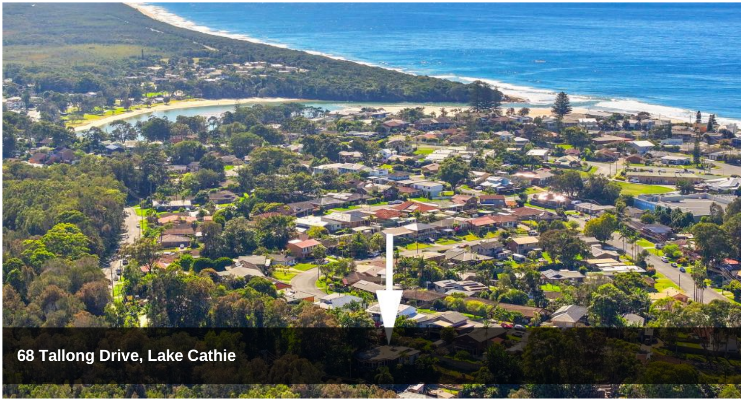
68 Tallong Drive, Lake Cathie