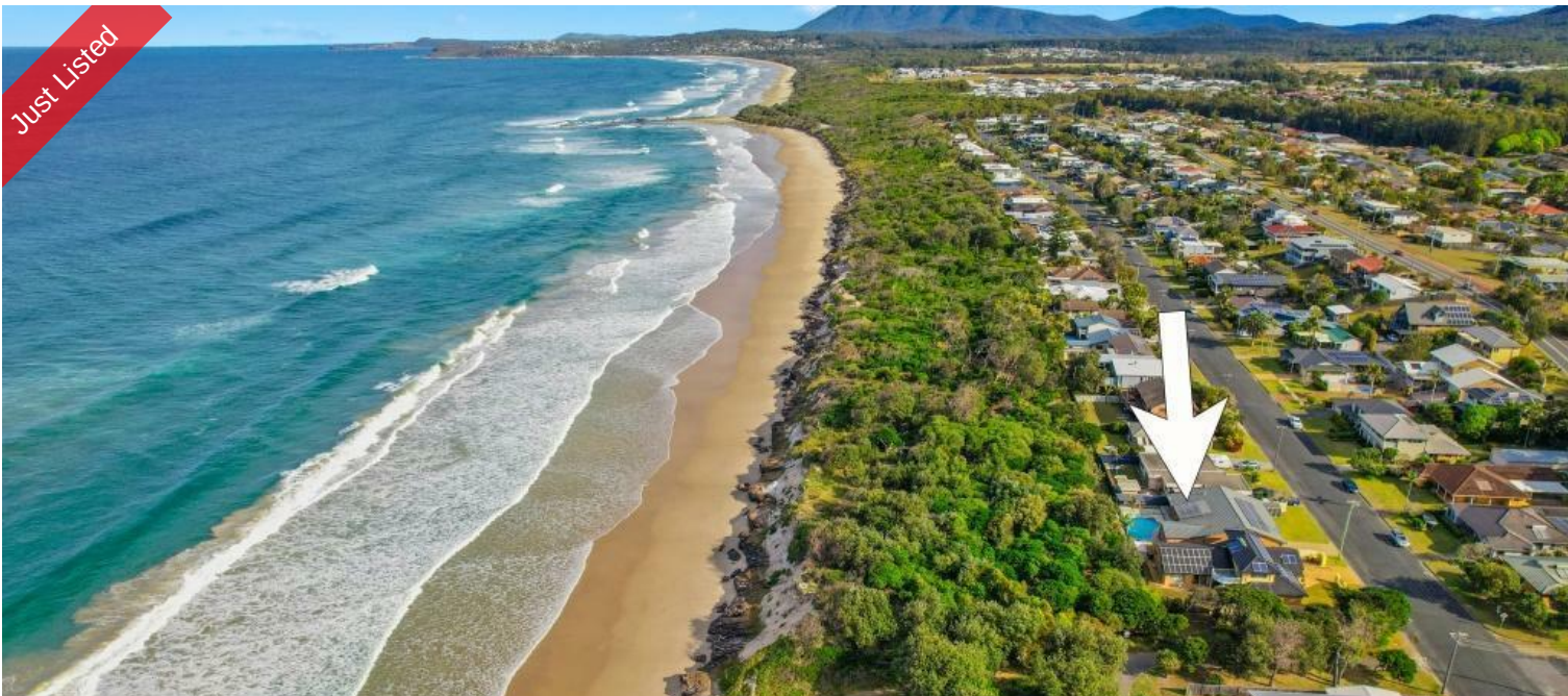
60 Chepana St, Lake Cathie