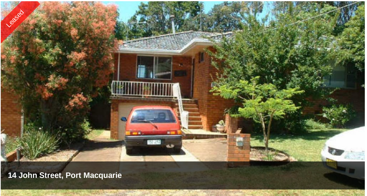
14 John Street, Port Macquarie