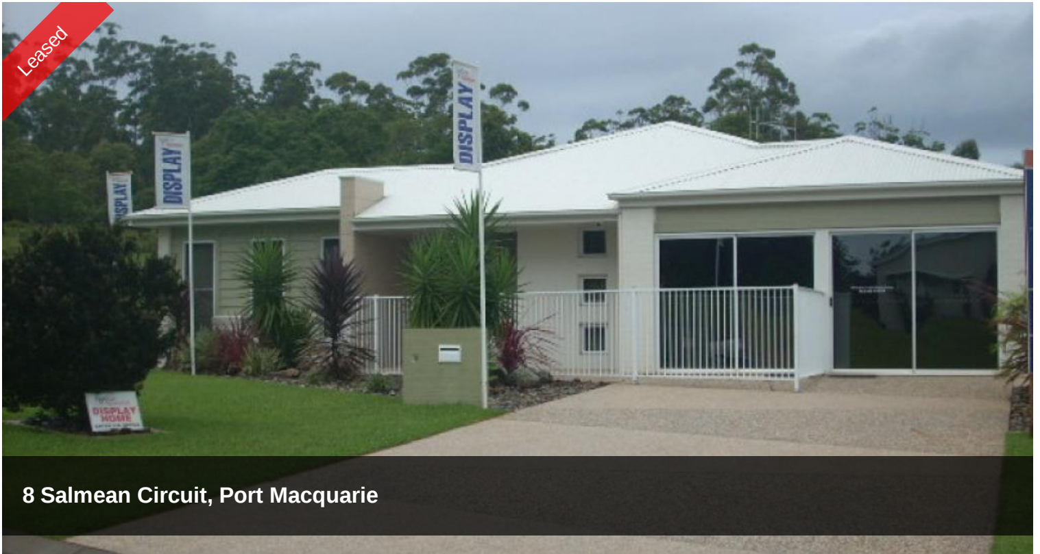
8 Salmean Circuit, Port Macquarie