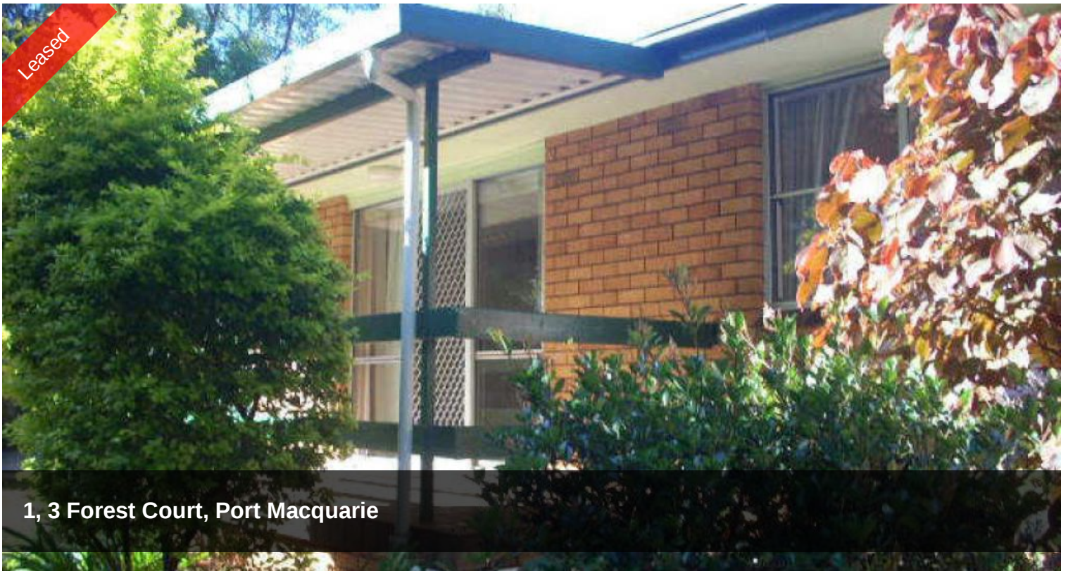
1, 3 Forest Court, Port Macquarie