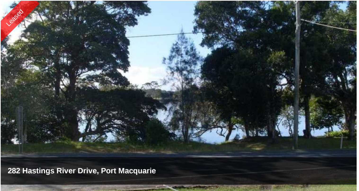
282 Hastings River Drive, Port Macquarie