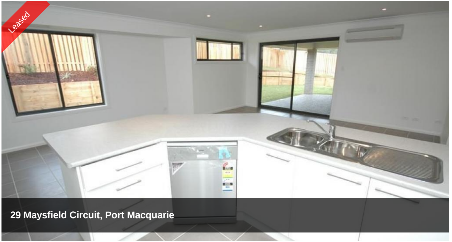
29 Maysfield Circuit, Port Macquarie