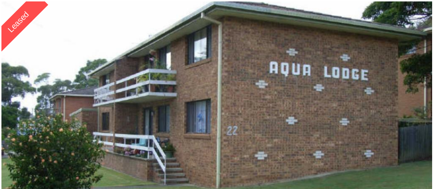
3, 22 Aqua Crescent, Lake Cathie