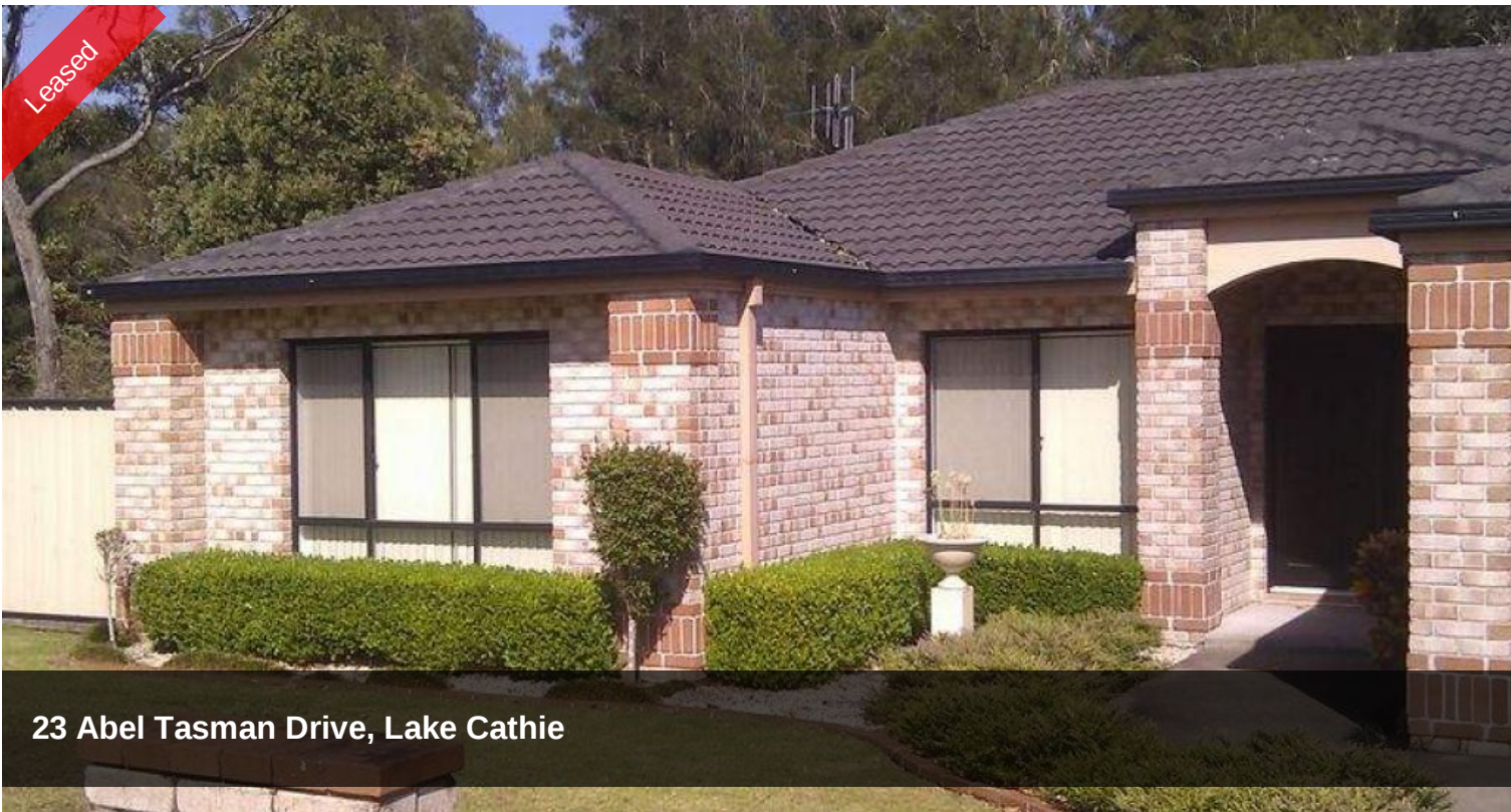
23 Abel Tasman Drive, Lake Cathie