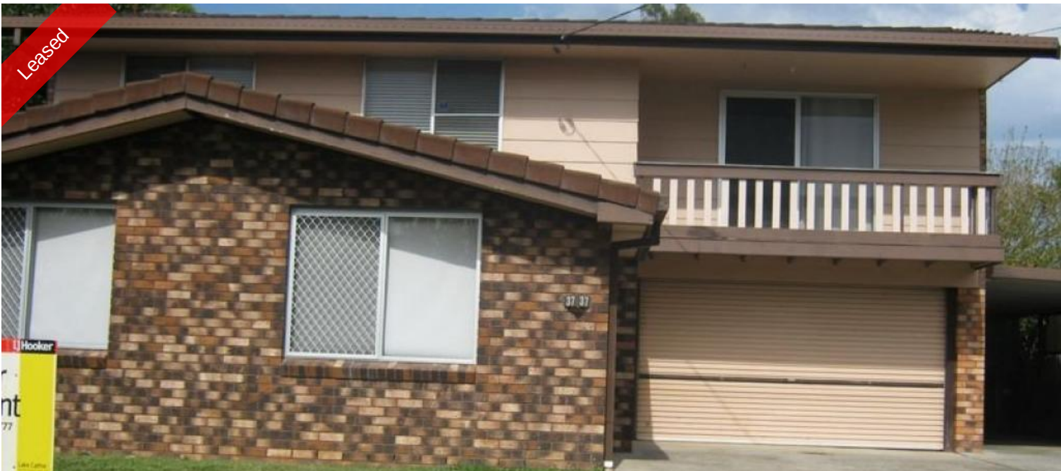
37 Cathie Circuit, Lake Cathie